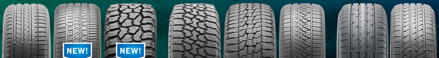
AZENIS FK510 AZENIS FK460 A/S WILDPEAK R/T WILDPEAK A/T3W WILDPEAK A/T TRAIL ZIEX ZE960 A/S SINCERA SN250 A/S ZIEX CT60 A/S